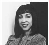
Three-Time New York Times Bestseller

Keynote Speaker ~ Bebe Moore Campbell Author of the emotionally-charged novel 72 Hour Hold and the award-winning children's book, Sometimes My Mommy Gets Angry . Plus: